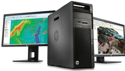
HP Z640 Workstation interactive tour