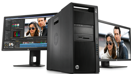
HP Z840 Workstation interactive tour